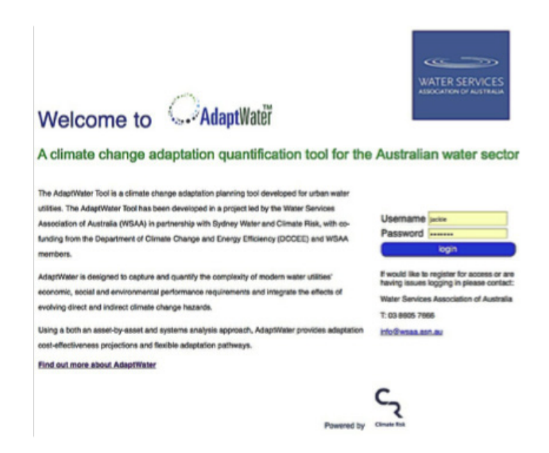
Figure 1: AdaptWater™ is an online tool for adaptation planning that was developed for the water industry and that has potential for other types of infrastructure.