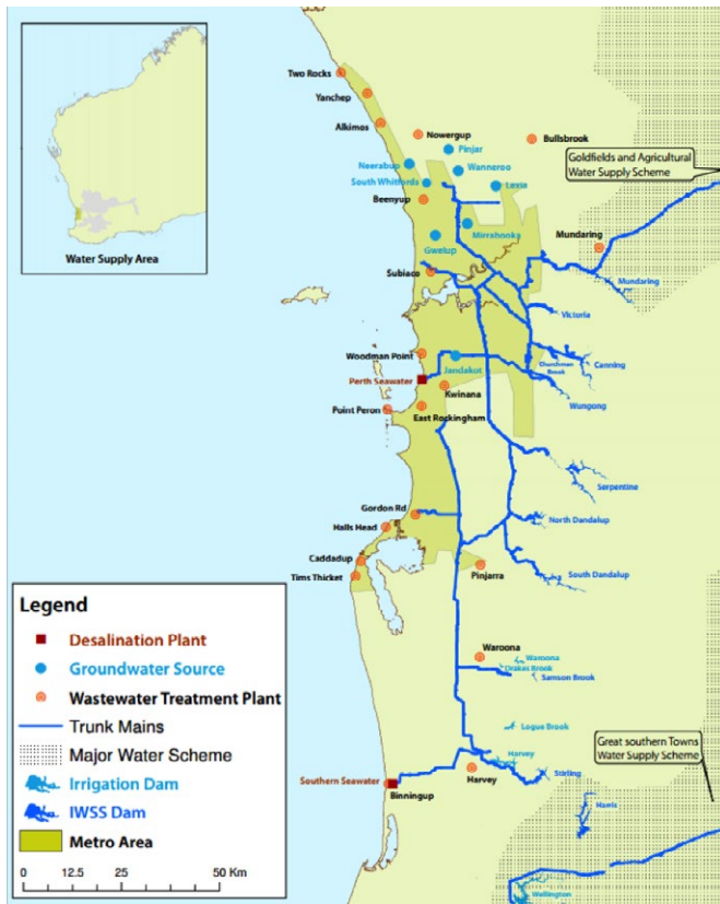
Figure 2: Diversified sources of water under Integrated Water Supply Scheme.